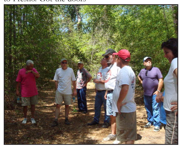
Nature tour at El Rancho