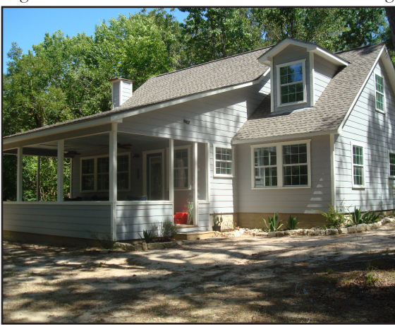
El Rancho Nuevo (aka El Rancho Neglecto)